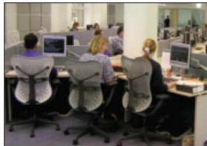
Call centers have morphed into contact centers that handle telephone calls, e-mail and online chat.

business today. Have you ever sent an e-mail or instant-message to arrange a good time to "call"? ■