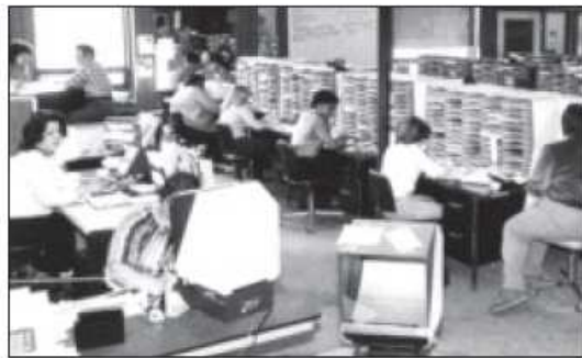
A call center in 1983.

The era of sophisticated inbound routing, call reports and "please wait" messages began in 1973 when Continental Airlines installed the first automatic call distributor phone system. In 1981, the GE Answer